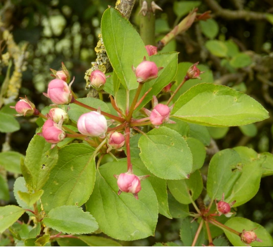
Crab apple blossom in Dale Lane ...