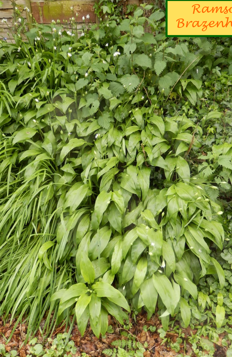
Ramsons in Brazenhill Lane