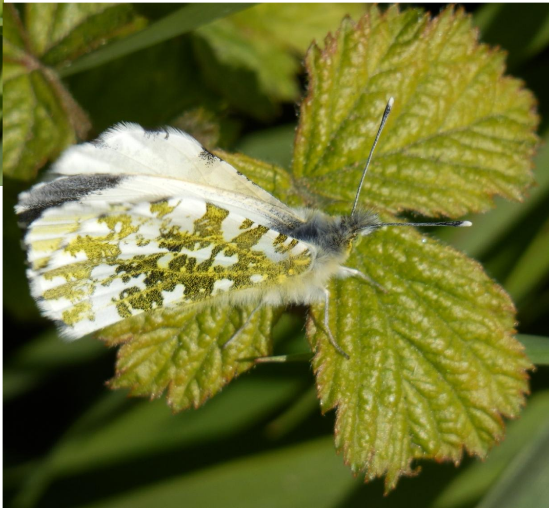
A female orange tip butterfly in Watery Lane