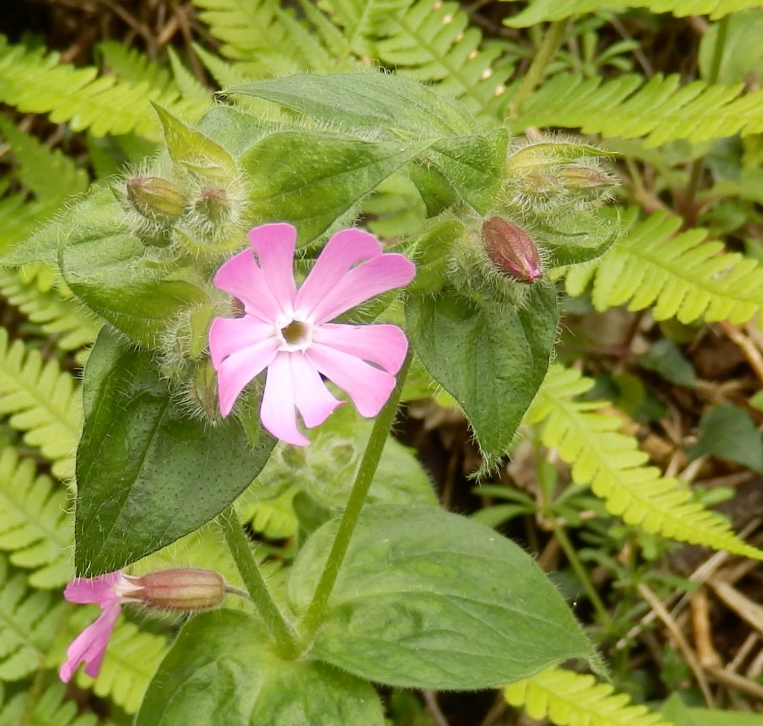
This red campion is at the east end of Grassy Lane.