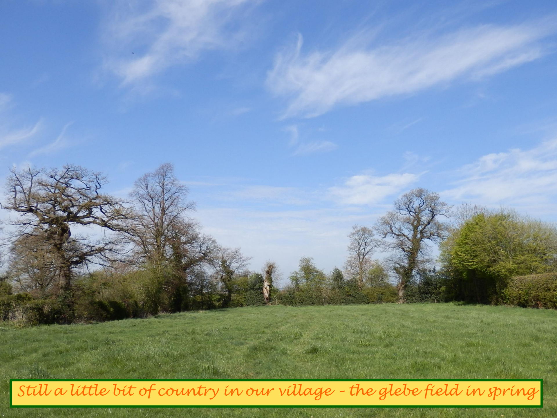
Still a little bit of country in our village - the glebe field in spring