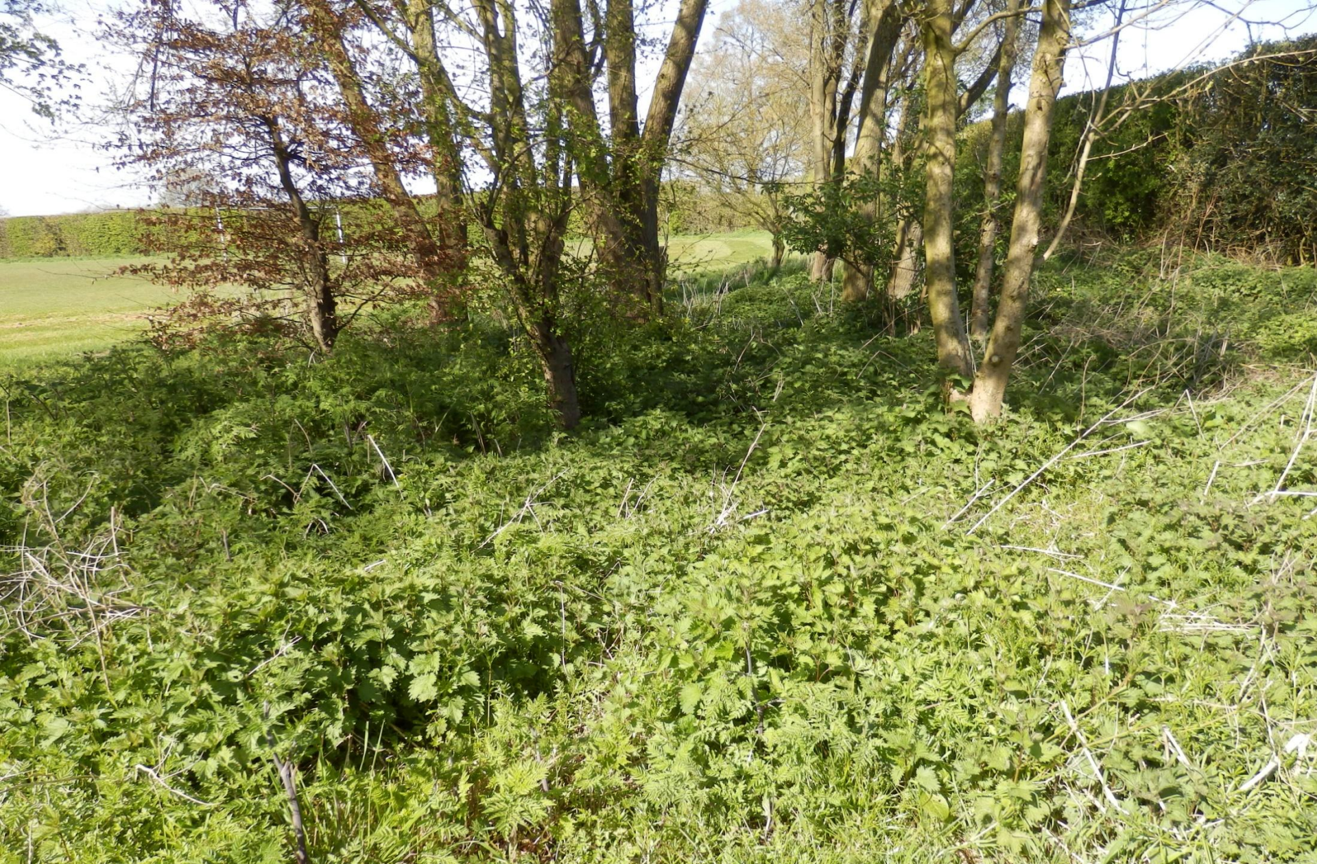
The nettle bed in the small copse at the playing field is buzzing with bees.