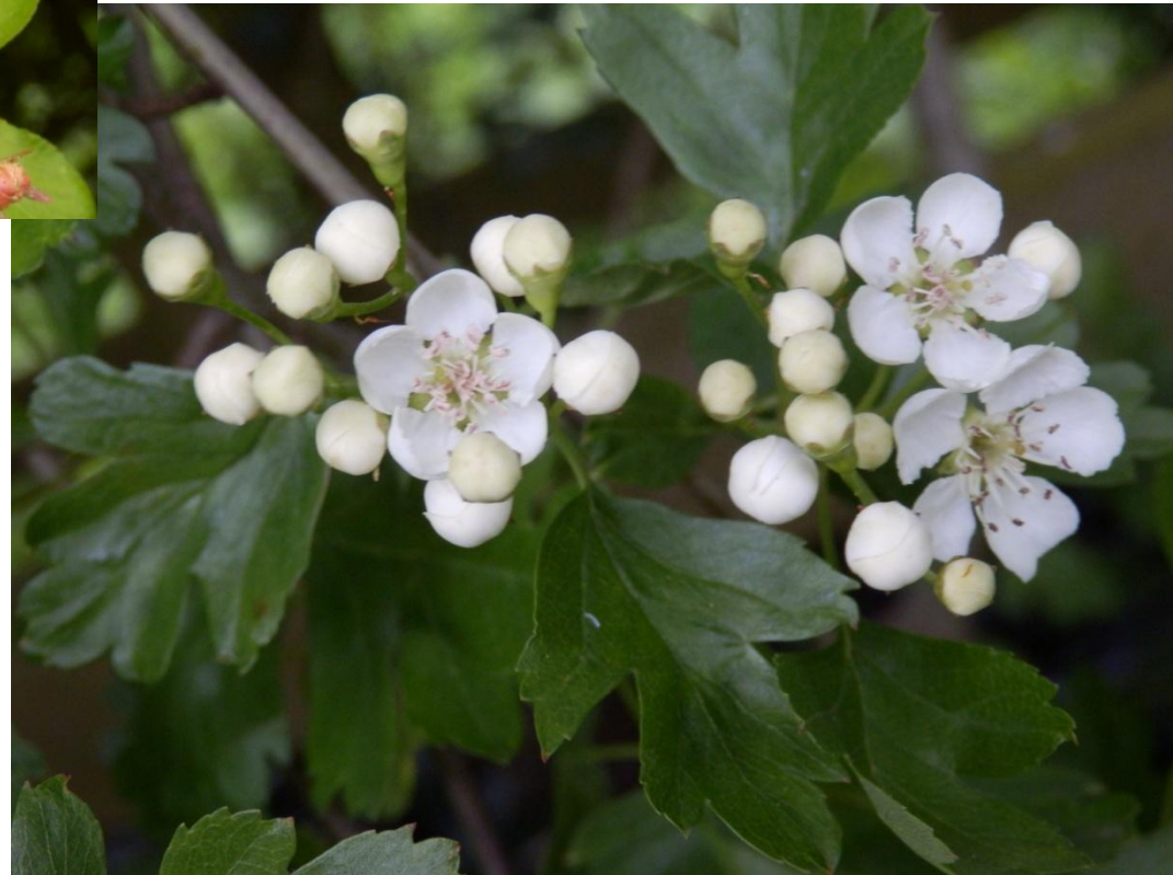
... and the first may blossom in Back Lane