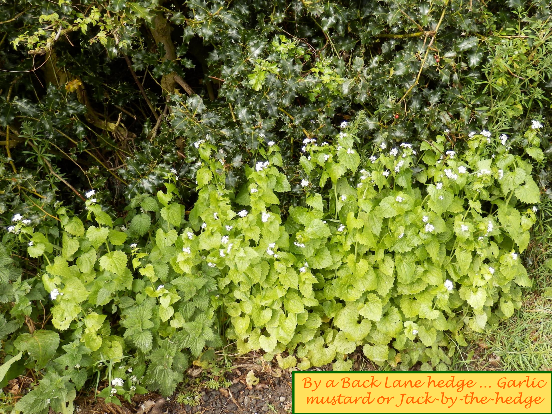
By a Back Lane hedge ... Garlic mustard or Jack-by-the-hedge